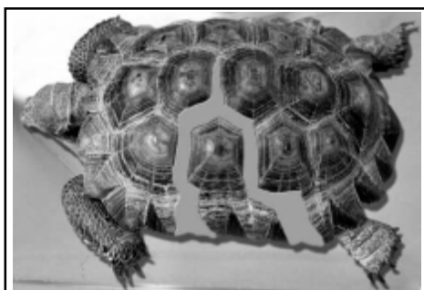
Figure 2 The same CDT as in Figure 1, after stabilization and repair of the shell with dental acrylic.

Proponents of their use feel they help combat shock, increase tissue perfusion (blood flow), stabilize injured cell membranes, and generally results in an improved outcome. Steroids are usually administered as prednisolone sodium succinate (Solu-Delta-Cortef) at 5-10 mg/kg, or dexamethasone sodium phosphate at 0.1-0.25 mg/kg. Following steroids come antibiotics. There is a wide range of choices, based on severity of the wounds, route of administration, and availability of the drugs. These may be administered for as little as three weeks, to as long as six months (see the section on bloodwork analysis below). Infection must be controlled in order to prevent abscess formation once the wounds are closed. Antibiotics commonly used include amikacin (Amiglyde) at 5 mg/kg initially, then 2.5 mg/kg every three days; late-generation cephalosporins such as cefotaxime (Claforan) at 20 mg/kg once daily (often used with amikacin) or ceftazidime (Taxidime) at 20 mg/kg every third day; enrofloxacin (Baytril) at 5 mg/kg once daily; piperacillin (Piperacil) at 100 mg/kg once daily (often used with amikacin); and trimethoprim/sulfa (Bactrim, Sulfatrim, generic) at 30 mg/kg initially, then 15 mg/kg once daily. At this point, if the animal is stable, the wound can be lavaged with warm 1:10 diluted chlorhexidine solution to remove as much of the road debris as possible. The